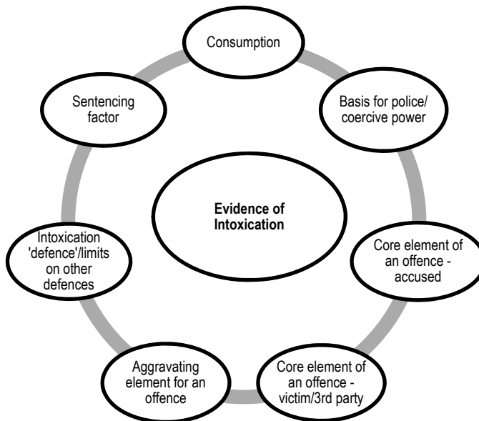
Figure 1: Purposes for which Criminal Law Statutes Attach Significance to Intoxication

The second dimension involved identifying the major 'sites' in which criminal law–intoxication provisions operate. For our purposes, 'site' is an amalgam of a number of considerations including location, activity and rationale. Four primary sites were identified which were defined at a high level of generality as follows: